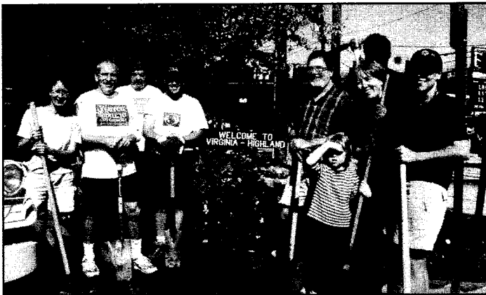
Volunteers at the annual fall Virginia-Highland Triangle planting.

Are you tending to a public space or do you know of a public space that should be taken better care of? Let the Parks Committee know so we can include these spaces in our future projects.